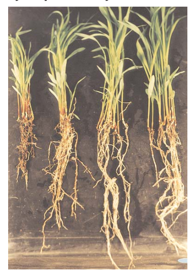
From left: uncured, semicured, cured, control

Figure 3. Container grown sorghum-sudangrass as affected by compost maturity